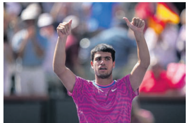
Carlos Alcaraz, of Spain, celebrates after defeating Fabian Marozsan, of Hungary, at the BNP Paribas Open tennis tournament Tuesday, March 12, 2024, in Indian Wells, Calif.

On the women's side, top-seeded Iga Swiatek had a 6-1, 6-2 win over Yulia Putintseva, Caroline Wozniacki beat Angelique Kerber 6-4, 6-2 in a contest